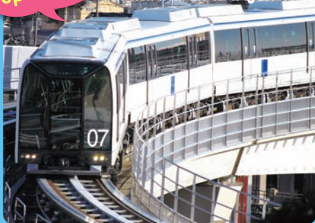
The view from the car is spectacular!